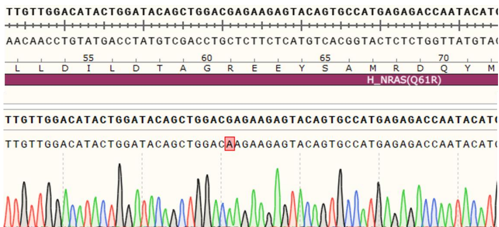
Figure 2 | The NRAS mutation analysis by Sanger sequencing.